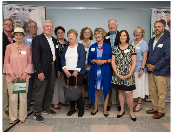
Group