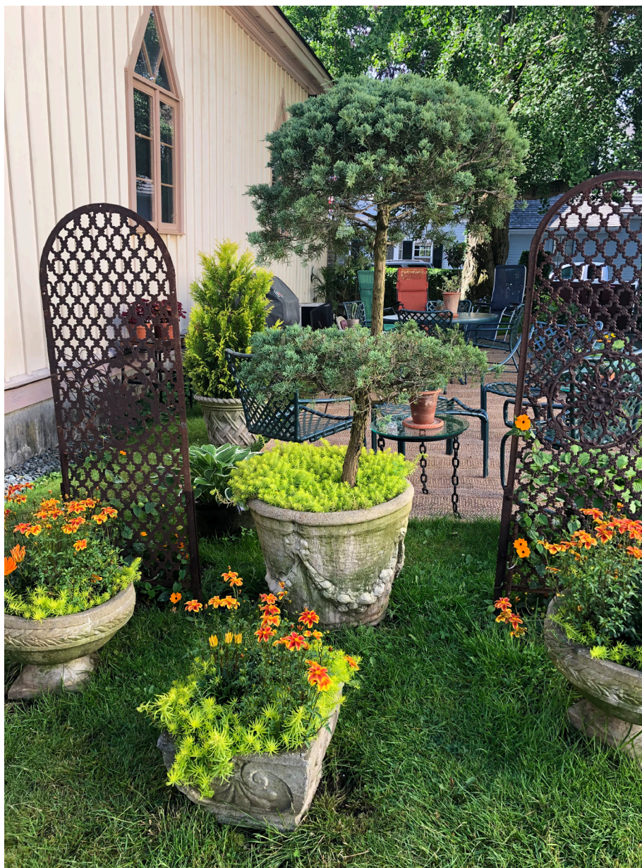
Welcoming Garden at St. John's Church During the Secret Garden Tour