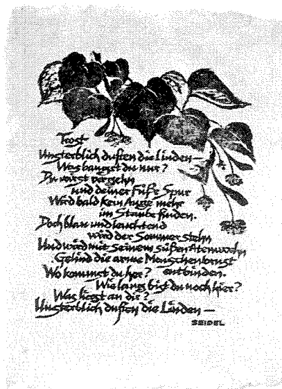
A page from Steigendes, Neigendes Leben

Steigendes, Neigendes Leben comprises twelve poems by twelve 19 th and 20 th century German po-